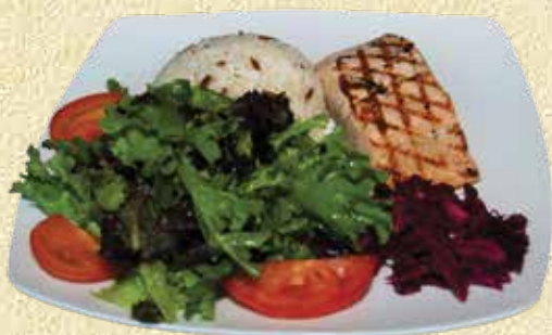
Fillet of Grilled Salmon