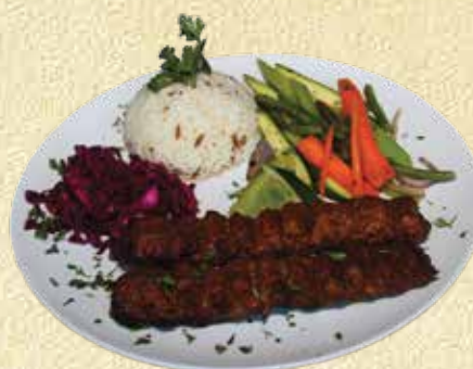
Lamb Adana Kebab