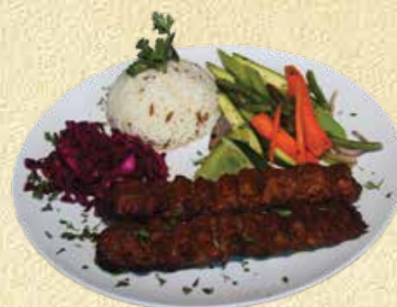
Lamb Adana Kebab